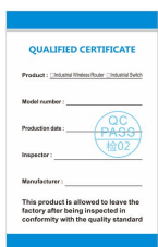
Certificate of conformity *1