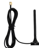
2 m suction cup antenna -4G (Optional cabinet antenna, rubber stick antenna, etc.)