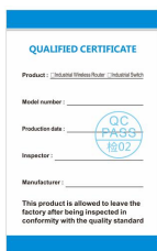
Certificate of conformity *1