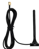
2 m suction cup antenna -4G (Optional cabinet antenna, rubber stick antenna, etc.)

Optional: British Standard / European Standard / American Standard