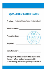
Certificate of conformity *1