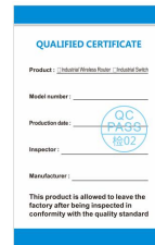
Certificate of conformity *1