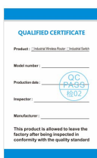
Certificate of conformity *1