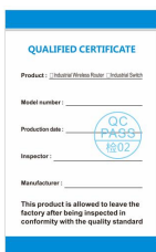
Certificate of conformity *1